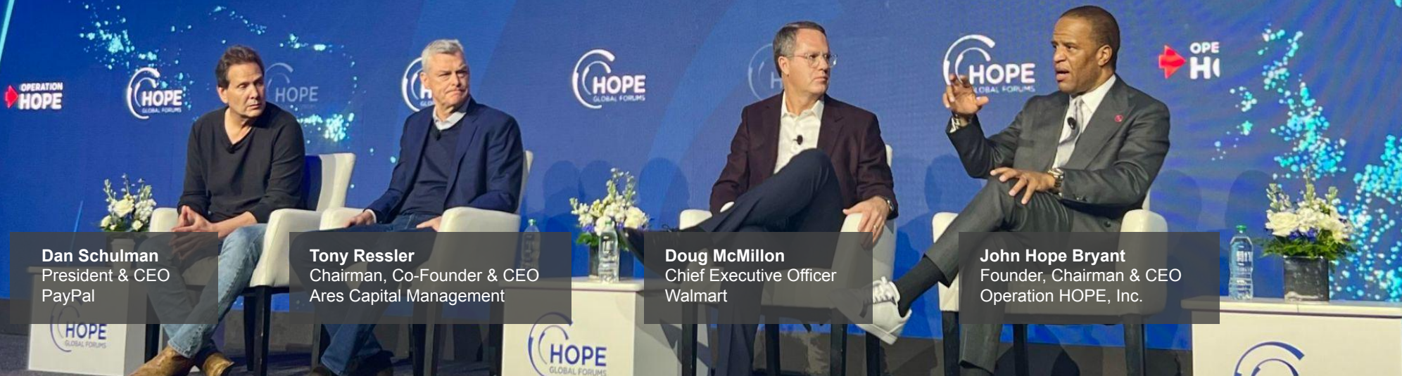
Dan Schulman President & CEO PayPal