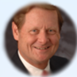
Steve Bartlett Former Member of the US Congress, Mayor of Dallas, and CEO of The Financial Services Roundtable

“I’ve been to Davos, to the Super Bowl, and to the National Conventions of both parties. If I were forced to choose only one, I would choose the HOPE Global Forum. For the ultimate in servant leadership, the HOPE Global Forum is the place to be, to learn, and to serve. The HOPE Global Forum finds the intersection of economic empowerment and human dignity. It is a place to learn, to teach, and to be inspired.”