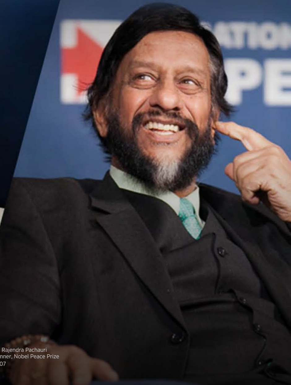
Dr. Rajendra Pachauri Winner, Nobel Peace Prize 2007