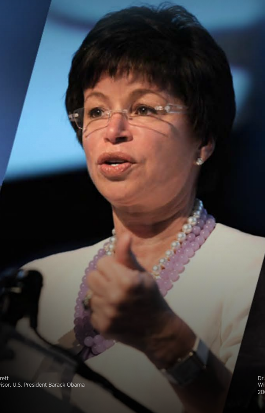
Valerie Jarrett Senior Advisor, U.S. President Barack Obama 2008-16