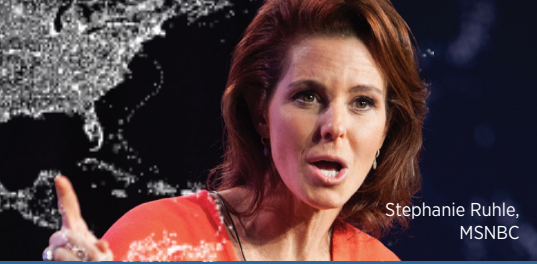
Stephanie Ruhle, MSNBC